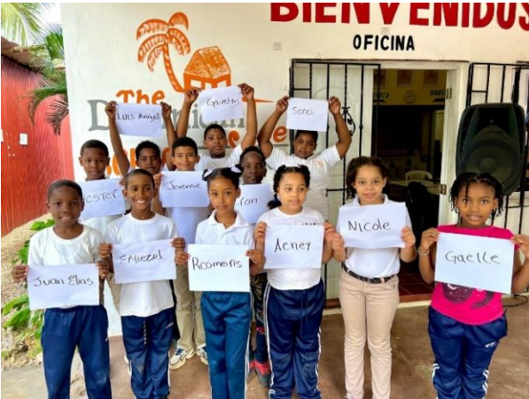
Our Grade School

We were able to obtain updated pictures of most of the Dominican Republic Sponsored children. They are all healthy and following their path in life as children with the tools to climb out of poverty. This year the school has sponsored 15 young graduates into college or higher education. When the ministry started 4 years ago, we had only 3. Please continue to pray for this ministry and thank God for its progress.