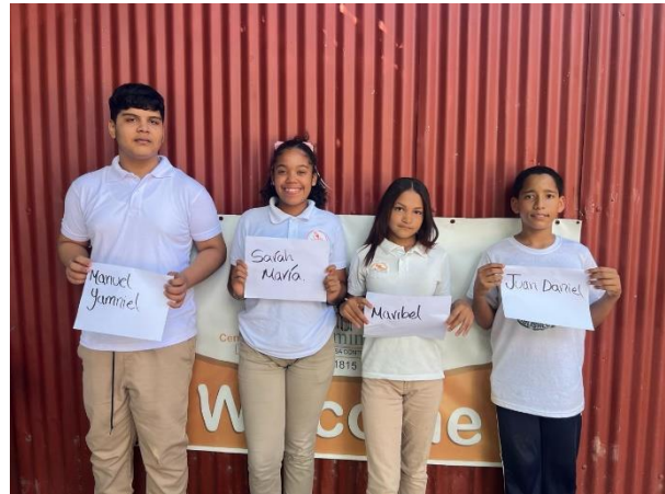
Our High Schoolers (They are growing up!)